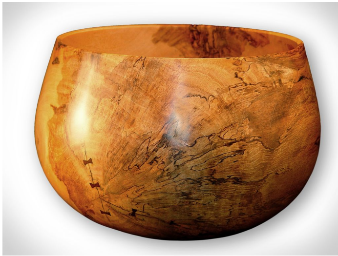
Pat Kramer's Kumauna 2004