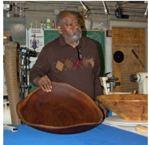
Here is a slightly smaller natural edge bowl- it's only 28 inches