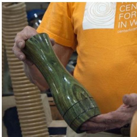
An English Walnut vase with glass test tube insert. Holds water!