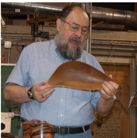
Emil Milan's Zebrawood Sculpture