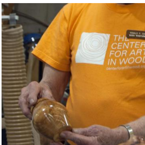
Here's a nice hollow turning of Red-bud wood.