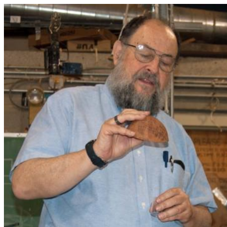
One of Joe Seltzer's own- a sand blasted Redwood Burl bowl.