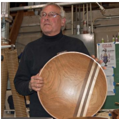
Jim Ruocco's large Cherry bowl sports stripes of Maple and Walnut.