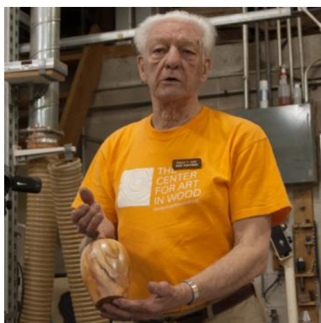
A hollow turned vessel made with Cherry Burl.