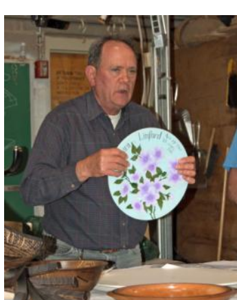
The design is realized in an anniversary plate presented to his wife.