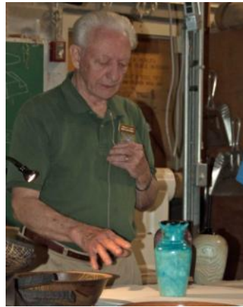
This is a Silver Maple turning with a wash coat of alkyd enamel.