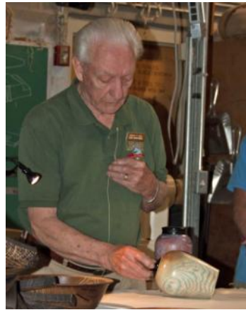
This Oak vessel gave him a little challenge-it was met with turned top.