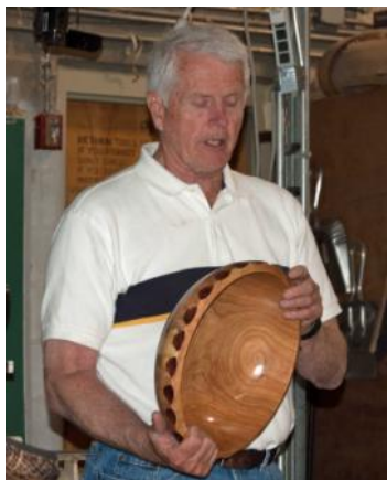
Bob Crowe's well-made cherry bowl with flutes via spindle sander.