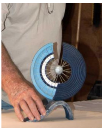
Just another “simple turning” knocked out by Ed..