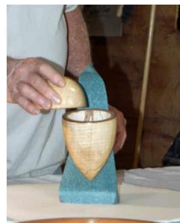
A lidded box and stand inspired by a turning magazine article.