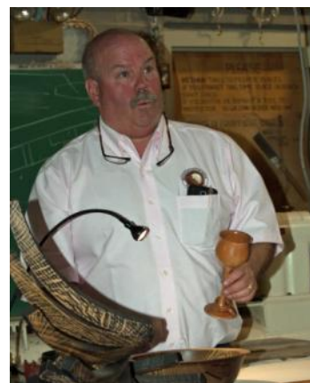
And something he is quite known for, a wedding goblet with captured rings.