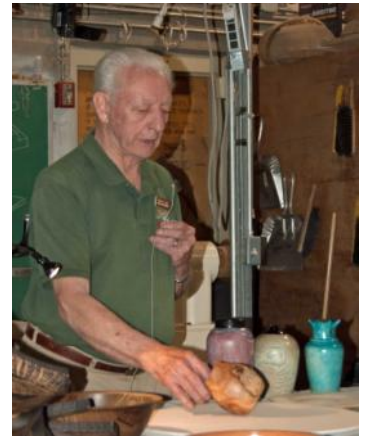
A small Yew turning from that roadside supply-some is still available.