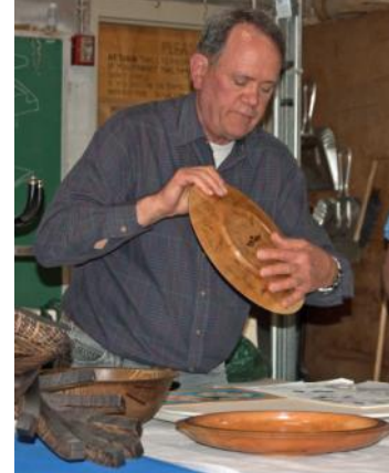
Those attending the anniversary party signed the back- nice touch!