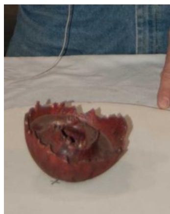
A closer view of the Rocking Vessel.