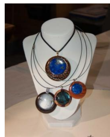
And he incorporated them into these beautiful necklaces with wood settings.